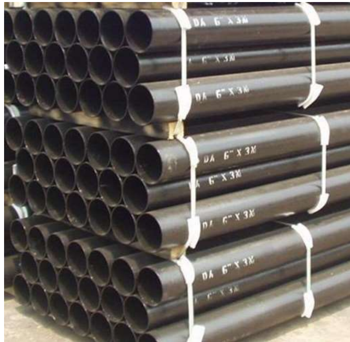
2017 ICP Cast iron drainpipe