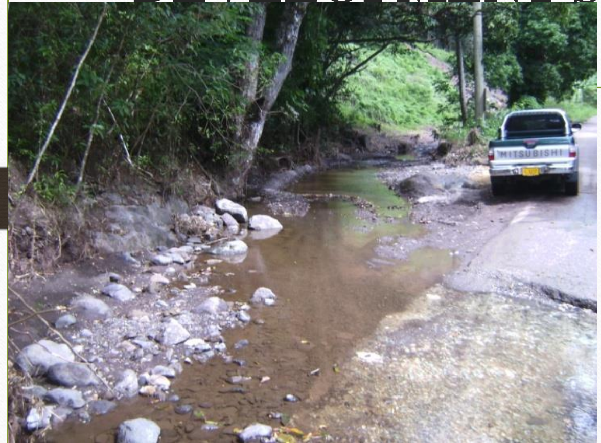
Sedimentation along the Southern Forest Watershed area Swetes to Old Road

WATERSHED AREAS AGRICULTURAL, DEVELOPMENT SLOPE ACTIVITES