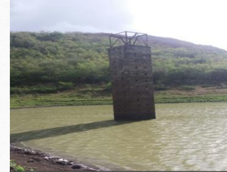
Pot Works Dam, May 2016,