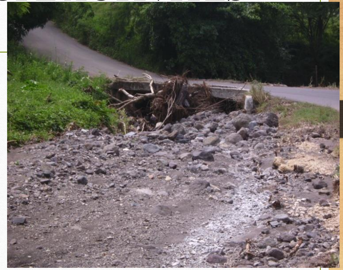
Rock slides blocking drains in Folly Ghaut Valley