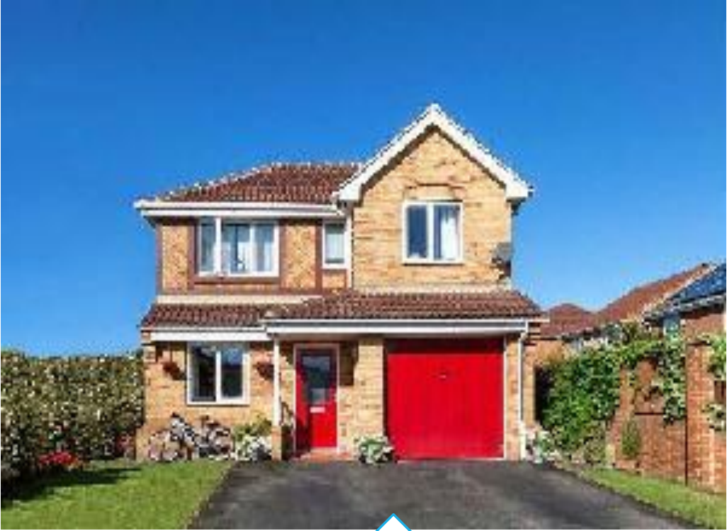
There is no wall in common, from the main house, with the neighbours