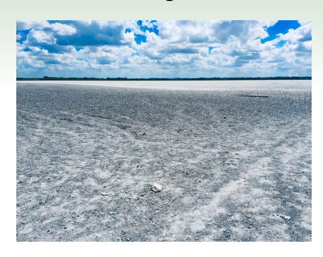
Prior to 2019