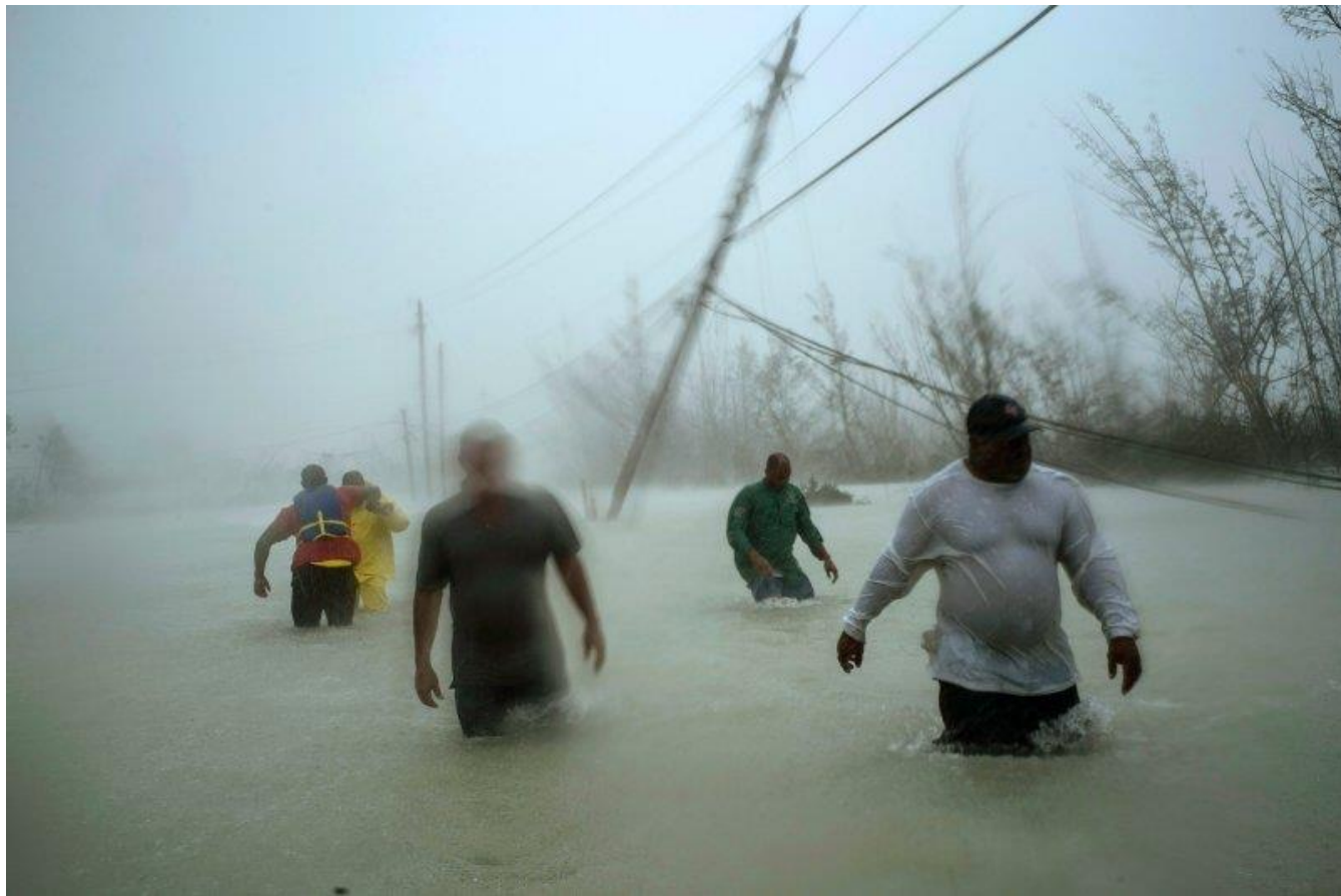
Volunteers wade through a flooded road against wind and rain caused by Hurricane Dorian to rescue families near the Causarina bridge in Freeport, Grand Bahama, Bahamas, Sept. 3, 2019. The storm's winds and muddy floodwaters devastated thousands of homes, crippled hospitals and trapped people in attics.