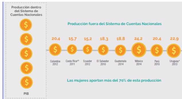
Figure 2 Latin America (8 countries): economic value of unpaid household work in relation to the national gross domestic product (GDP) (Percentages of GDP)