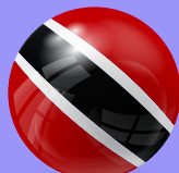
TRINIDAD AND TOBAGO