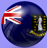
BRITISH VIRGIN ISLANDS