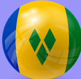
SAINT VINCENT AND THE GRENADINES