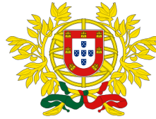
The Permanent Mission of Portugal to the United Nations