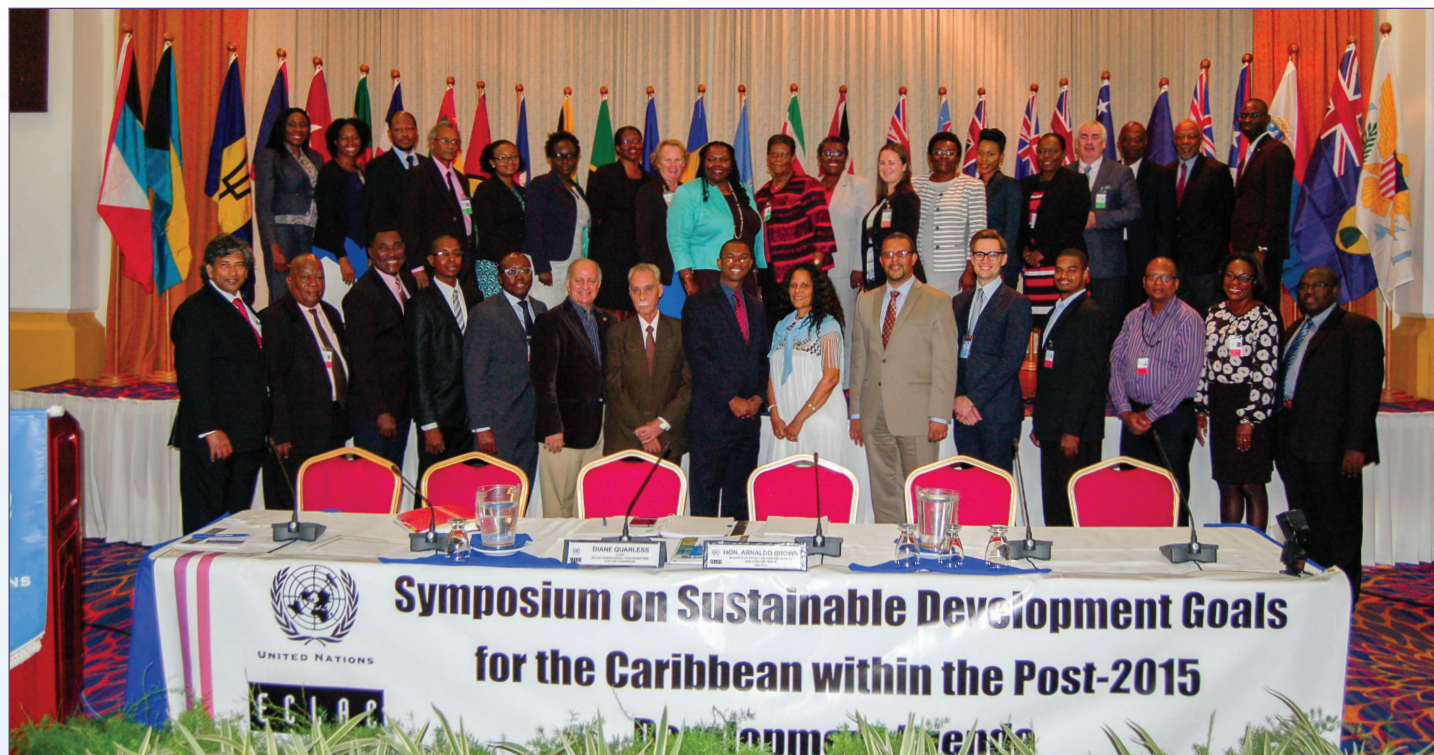
Official photo of the participants of the Symposium on Sustainable Development Goals for the Caribbean within the Post-2015 Development Agenda.— June 2015.