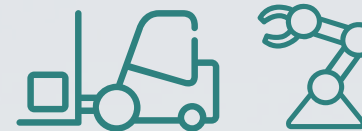
INDUSTRIAL APPLICATION & CONTROL

LOW COST, LOW ENERGY SMALL DATA VOLUMES MASSIVE NUMBERS