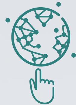
REMOTE MANUFACTURING, TRAINING, SURGERY