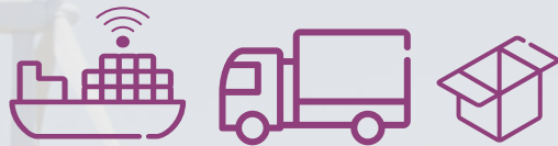
LOGISTICS, TRACKING AND FLEET MANAGEMENT