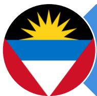
Antigua and Barbuda