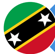
Saint Kitts and Nevis