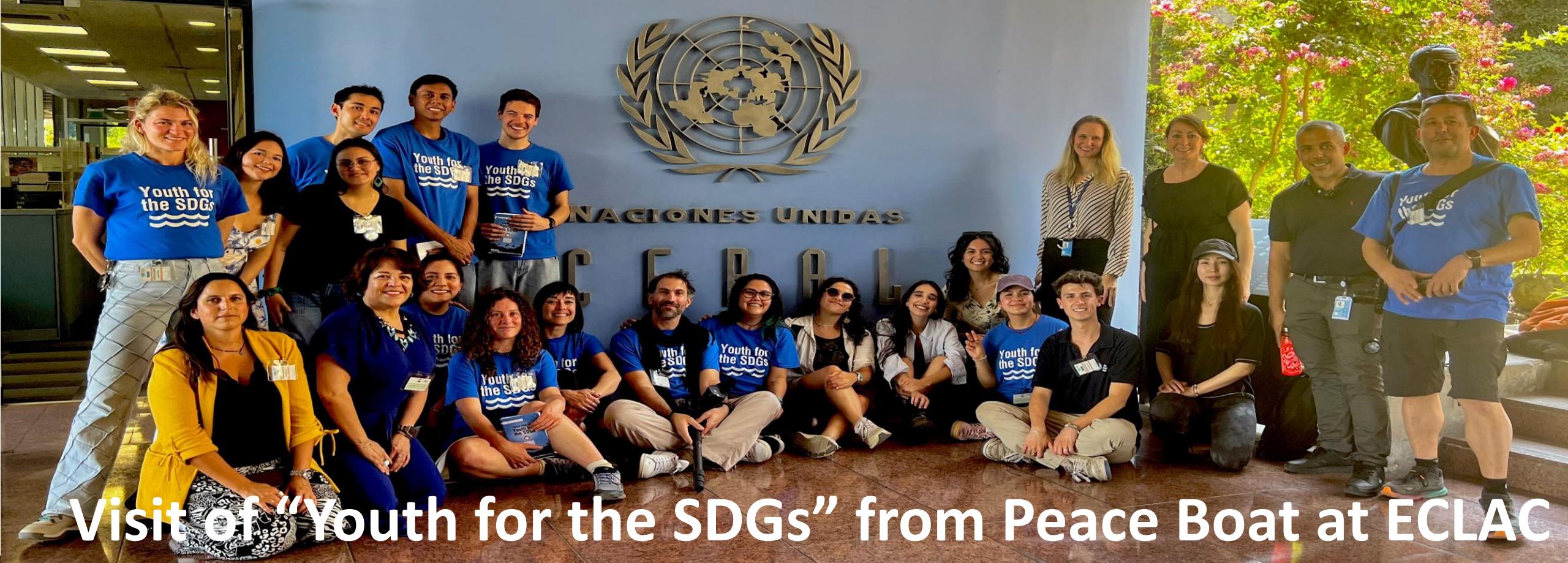
Visit of “Youth for the SDGs” from Peace Boat at ECLAC