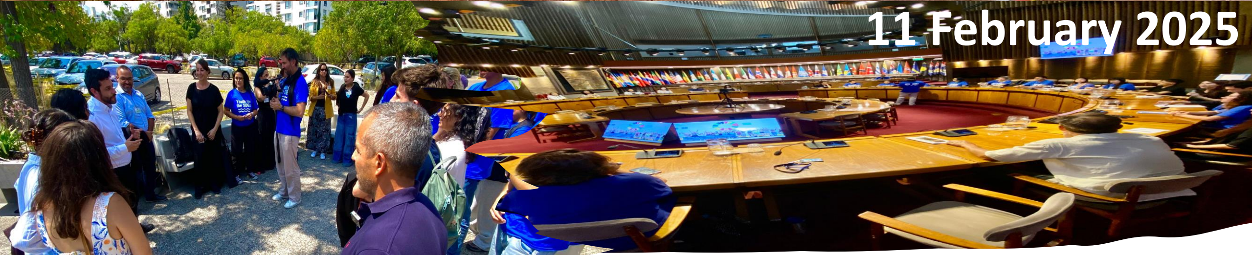
11 February 2025