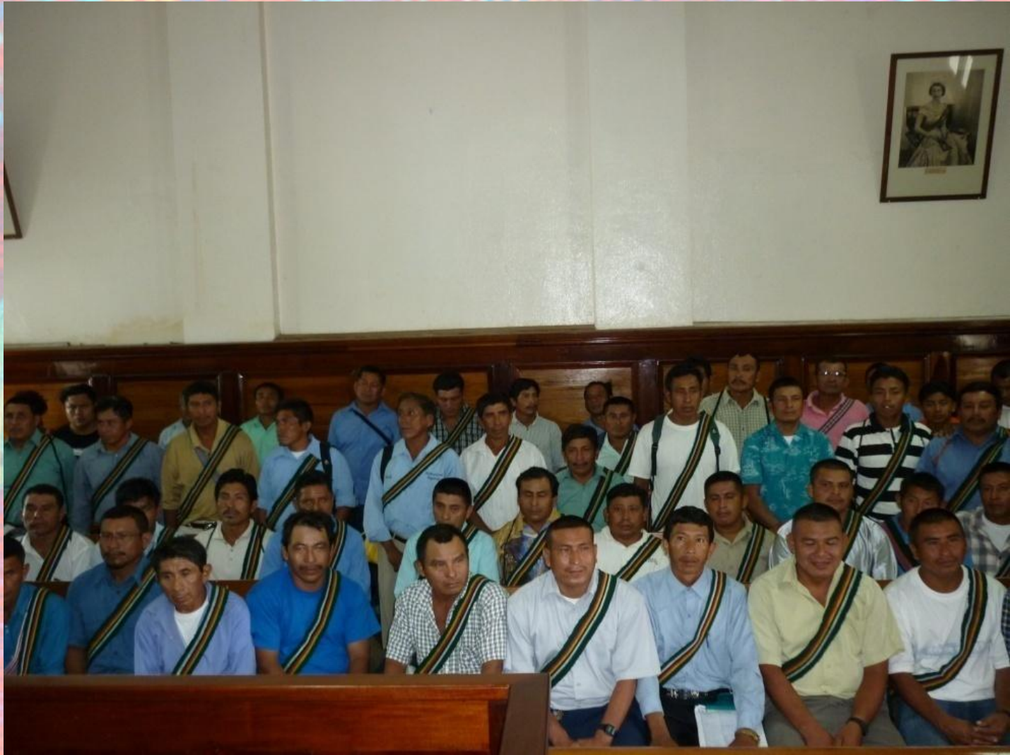
Traditional leaders at Supreme Court hearing 2010.