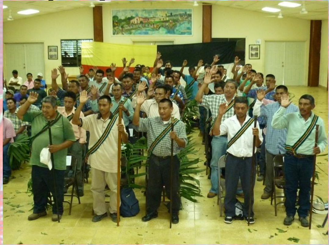
Coercion of leaders