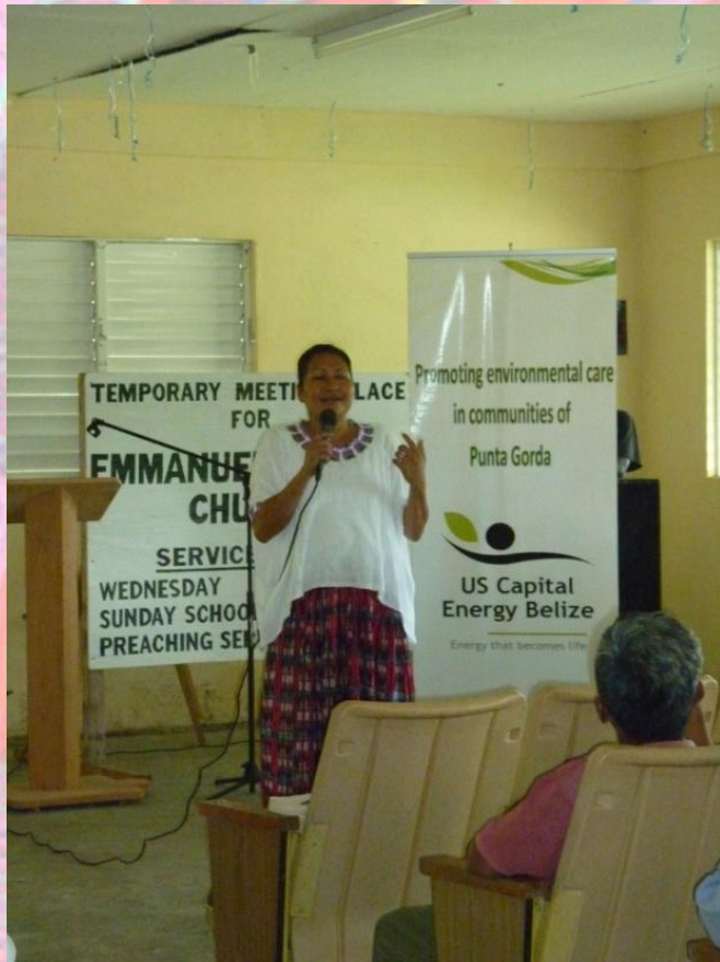
Q'eqchi Speakers hired by company