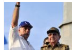
Confirmed Cases of Covid-19 in Cuba Reaches 35