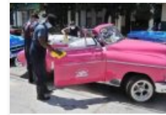
Cuba: Quarantine or Tourism?