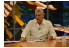
Cuba Closes Borders, only Citizens and Permanent Residents Allowed Back