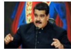
US Indicts Venezuela's Maduro on Narcoterrorism Crimes