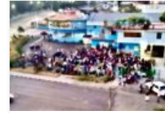
COVID-19 Without Masks in Havana