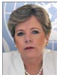
Alicia Bárcena is the Executive Secretary of the Economic Commission for Latin America and the Caribbean (ECLAC)

Latin America and the Caribbean is the only region in the world where, for the last four decades and without interruption, states have met to debate and commit politically to eradicating gender discrimination and inequality and moving toward guaranteeing the full exercise of women's autonomy and human rights.