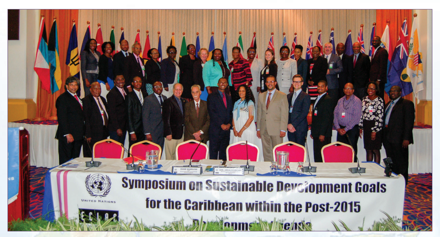
Official photo of the participants of the Symposium on Sustainable Development Goals for the Caribbean within the Post-2015 Development Agenda. — June 2015.